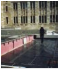
building for a better future