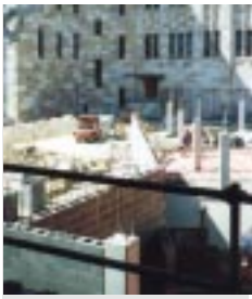
building for a better future