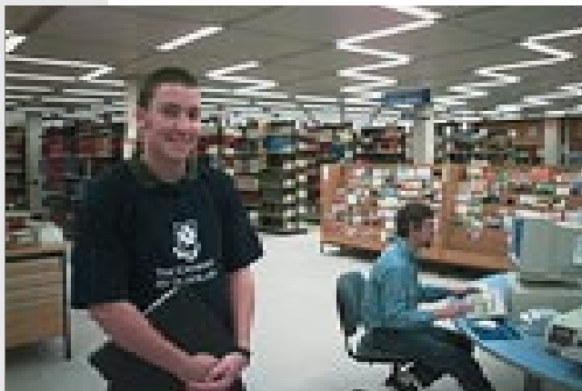
Below: Student Tour Leader ready to begin "Alternative" Orientation Tours of the Library