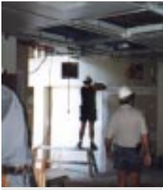
building for a better future