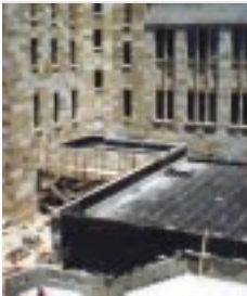
building for a better future