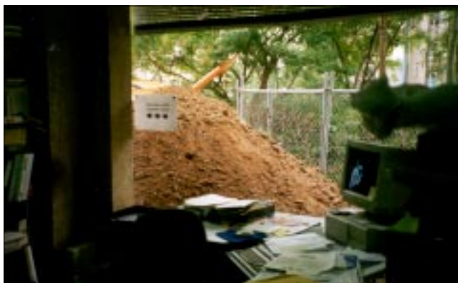
Above: the view from Information Access and Delivery section during construction!