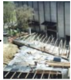
building for a better future

The Library reports through the Pro-Vice-Chancellor Academic Services, though this was under review at the end of 1997, and participates in the governance of the University through the University Librarian's membership of the Strategic Planning Committee, the Postgraduate Research Studies Committee of Academic Board, the Teaching and Learning Committee of Academic Board, the Academic Services Committee and the Academic Board itself.