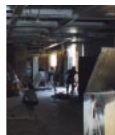
building for a better future