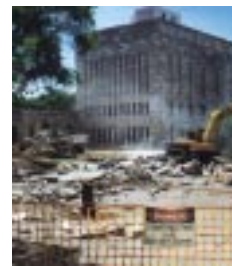
building for a better future

We value honesty, reliability and the maintenance of confidentiality in our relationships with staff and customers.