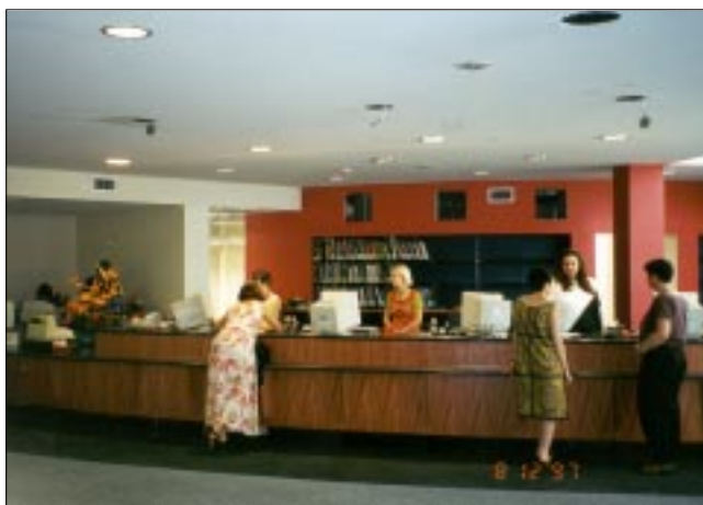
Above: Looking towards the Loans Desk from the new "Link" building

Steps were taken to dismantle the Parasitology collection, following review of that Department. The Centre for Nutrition