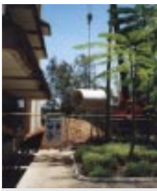
building for a better future