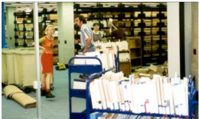
Right: Library staff at work on the collection

The University of Queensland Library has the largest collection of any library in the state