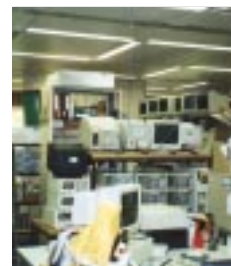
building for a better future