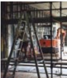
building for a better future