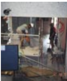
building for a better future