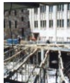
building for a better future