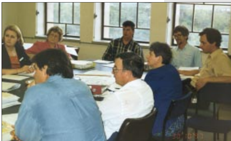
Below: Library Staff meeting to discuss Policy Issues

Three Library staff members joined a Working Party established by the Pro-Vice-Chancellor to promote more widely awareness of customer service attitudes and concepts. This was in part funded by resources received by the University under Quality initiatives.