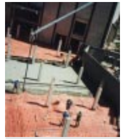
building for a better future