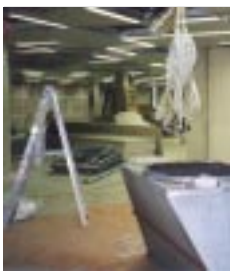
building for a better future