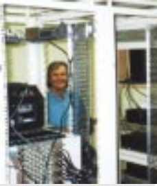
building for a better future