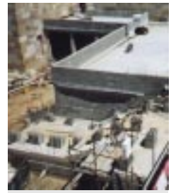
building for a better future