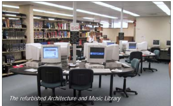
The refurbished Architecture and Music Library

The new Princess Alexandra Hospital Library opened to clients in April. The library's premises—three times larger than its previous site—featured an on-site collection of more than 3000 books and 400 journal titles, individual and group study areas, 12 networked computers, and state-of-the-art training rooms. As testimony to the quality of the new facility, the number of hospital staff using the library increased by 19 per cent and attendees at training sessions rose by 23 per cent during the year. The Minister for Health, The Hon. Wendy Edmond, and the University Chancellor, Sir Llewellyn Edwards, officially opened the library in October ( see photo on page 2 ).