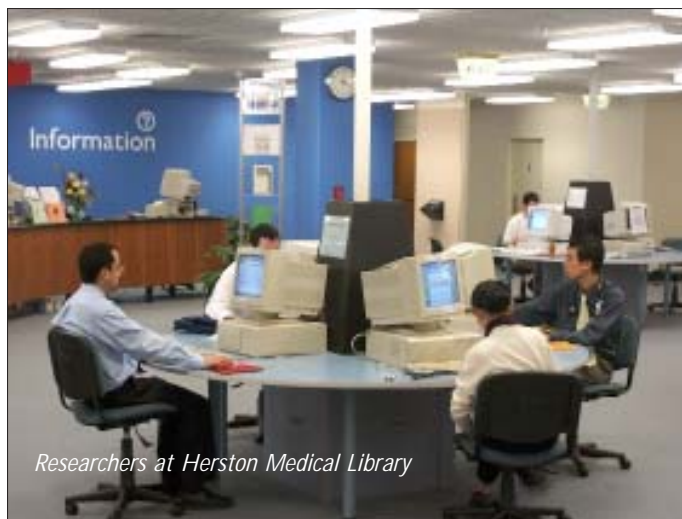
Researchers at Herston Medical Library

In addition, the Library confirmed it would cancel Elsevier science journal subscriptions to the value of $500,000, effective from 2002. As a consequence of the cut in expenditure, Elsevier indicated it would revoke its ScienceDirect service, which had provided full-text electronic access to more than 1000 Elsevier journals. To minimise the impact on teaching, learning and research, the Library implemented a new unmediated document delivery service to provide researchers with access to the most useful articles in the titles no longer available via ScienceDirect or in print.