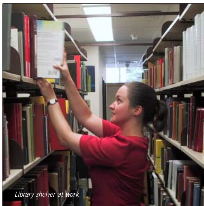
Library shelver at work