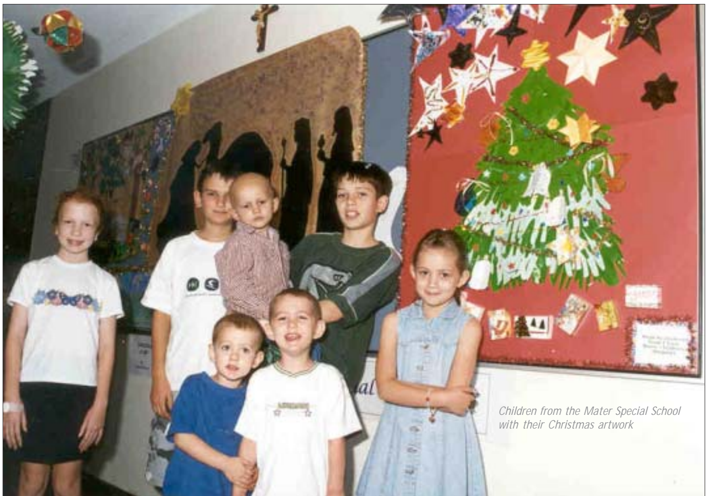
Children from the Mater Special School with their Christmas artwork

The award-winning UQL Cyberschool program and its qualified and experienced teacher-librarians provided: