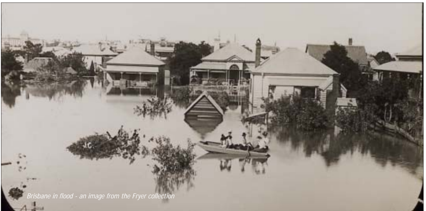
Brisbane in flood - an image from the Fryer collection