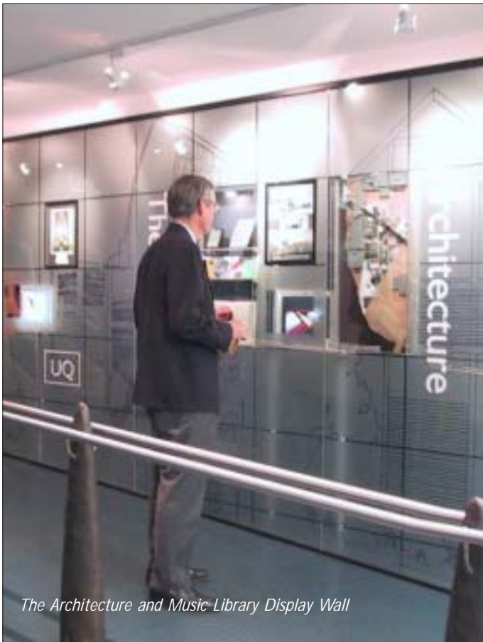
The Architecture and Music Library Display Wall

In addition to displays highlighting its services and resources, the Dorothy Hill Physical Sciences and Engineering Library showcased the work of three research centres in two displays. The Earthquakes in Queensland display, set up in conjunction with the Queensland University Advanced Centre for Earthquake Studies (QUAKE), featured information on earthquakes, equipment and tools that QUAKES uses to measure earthquakes. The Nanomaterials Centre and the Nanotechnology and Biomaterials Centre set up a display on nanotechnology and nanomaterials.