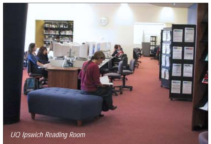
UQ Ipswich Reading Room

Approximately 230 staff worked at more than 20 service points in the 13 branch libraries. All branch libraries, regardless of size or location—across the three campuses, St Lucia, Ipswich and Gatton, in several teaching hospitals and at the Dental School—provided consistent access to resources and services.