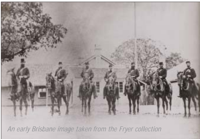
An early Brisbane image

To ensure that deteriorating films and videos were preserved, the Library investigated the best ways to enhance access to these materials by converting 'at risk' resources to digital formats.