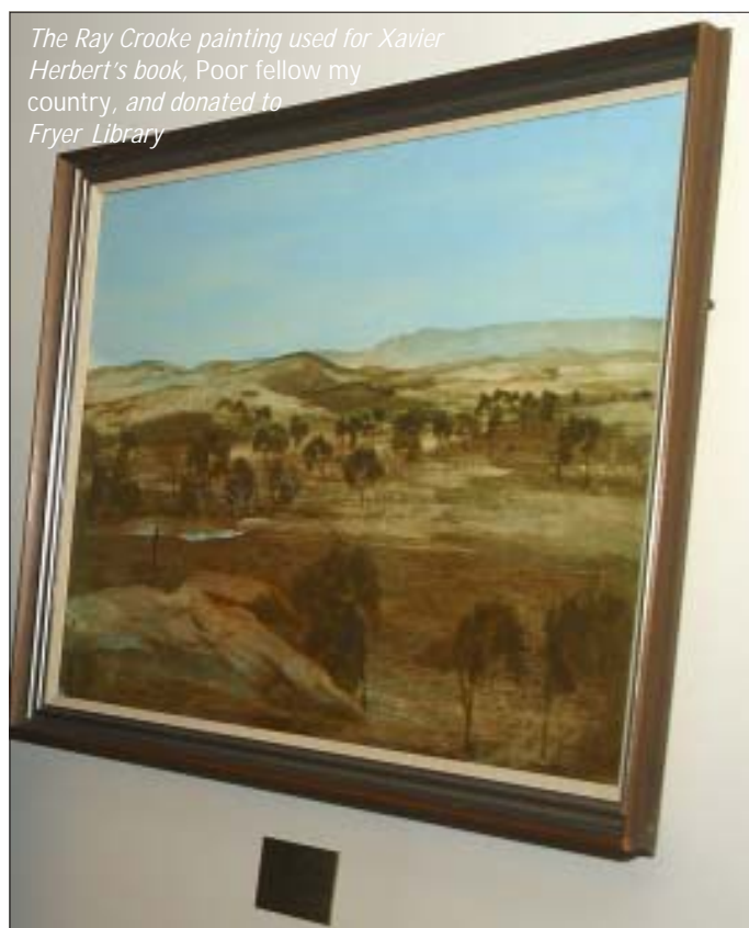
The Ray Crooke painting used for Xavier Herbert's book, Poor fellow my country, and donated to Fryer Library

The Australian Dental Association (Queensland branch) increased its annual contribution to the Dentistry Library from $3000 to $5000.