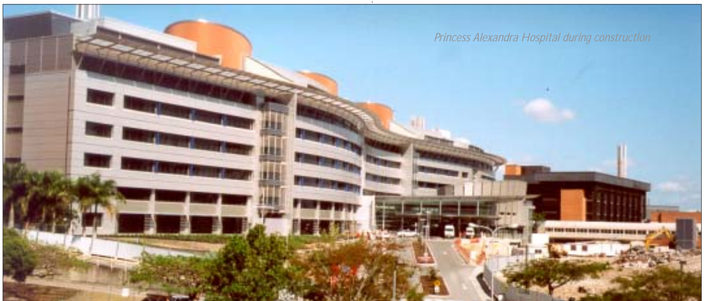
Princess Alexandra Hospital during construction

The completion of the remodelled Architecture and Music Library in July provided clients with access to more computers, an interactive music training facility and a dedicated graduate study area. A key feature of the six-month renovation project was a new entrance which improved disabled access and a versatile glass display wall ( see picture on page 14 ).