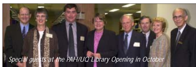
Special guests at the PAH/UQ Library Opening in October

The opening of the new Princess Alexandra Hospital Library ( see cover ) and the unveiling of the remodelled Architecture and Music Library were among the more visible achievements. The new Princess Alexandra