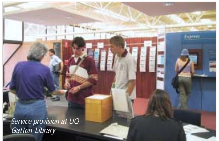
Service provision at UQ Gatton Library

Other priority groups that continued with projects from 2000 were Digitisation, Cybiz, AskaCybrarian and High Use Heaven.