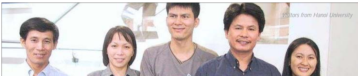
Visitors from Hanoi University

(Kinetica), OCLC (the largest catalogue in the world), as well as direct access to the Cybrary catalogue. 27,028 items were supplied on interlibrary loan to other libraries.