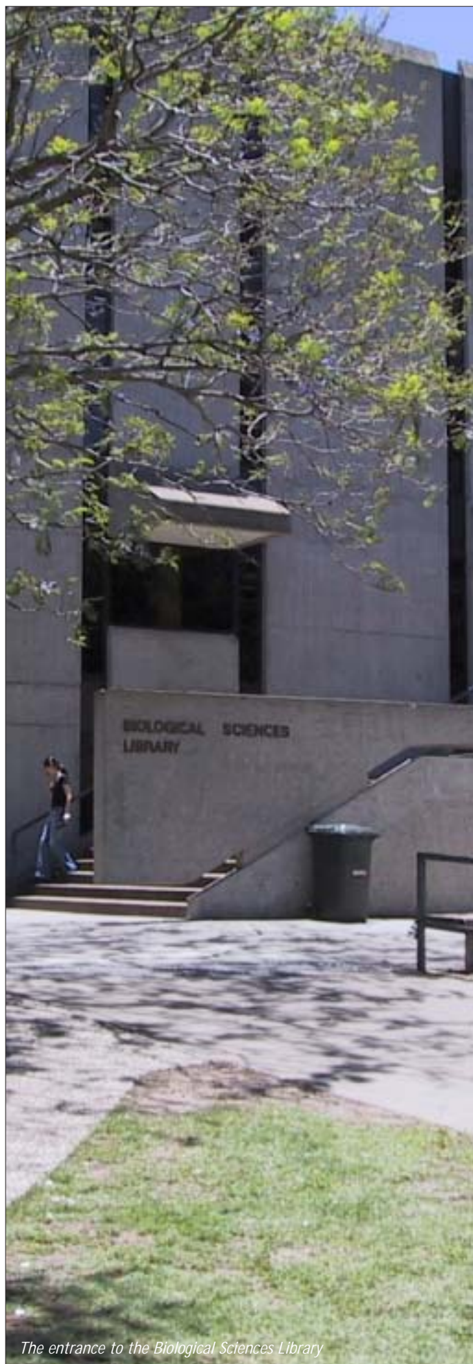
The entrance to the Biological Sciences Library