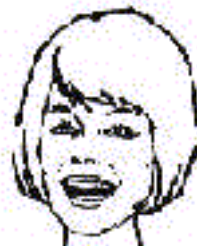
From Lunchroom to Boardroom logo