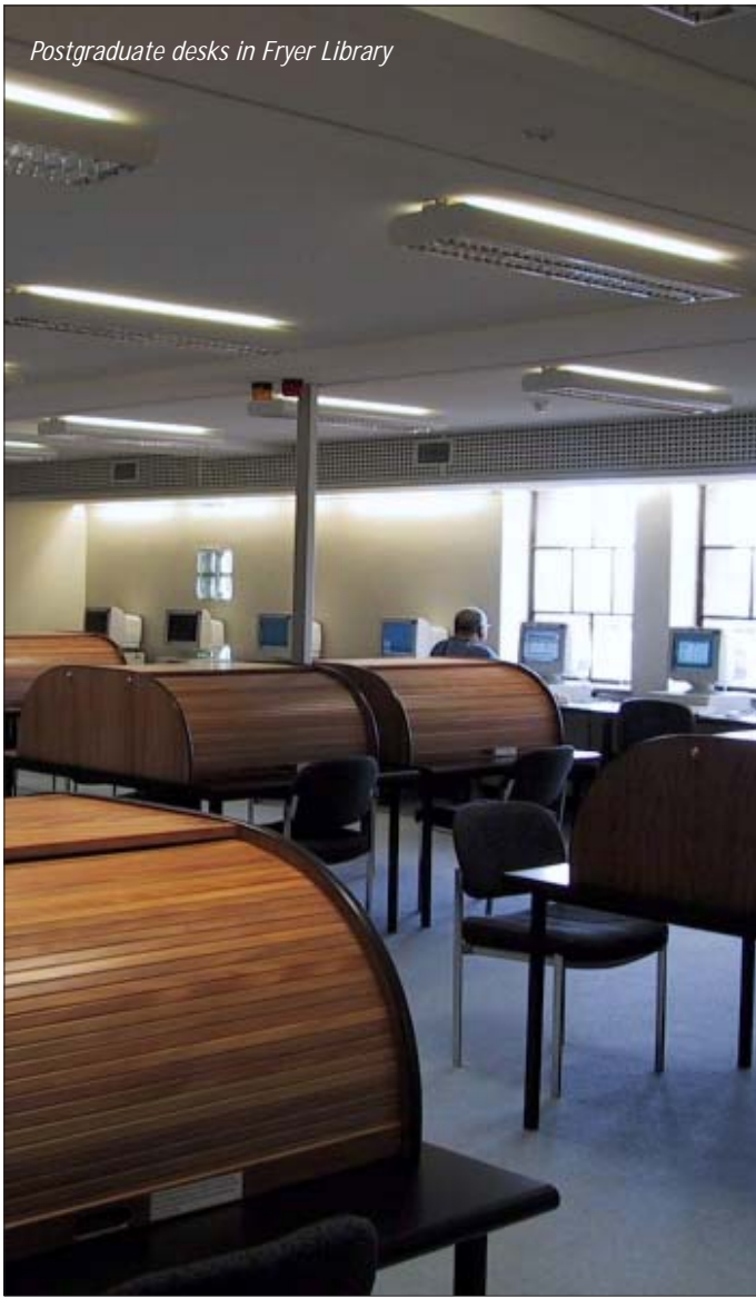
Postgraduate desks in Fryer Library